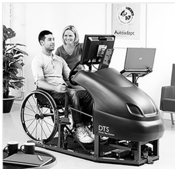
Mobility Engineering: Driver Assessment

“You will need to do a driver assessment with a qualified Occupational Therapist if you've never had your licence before or if your functionality levels have changed.”