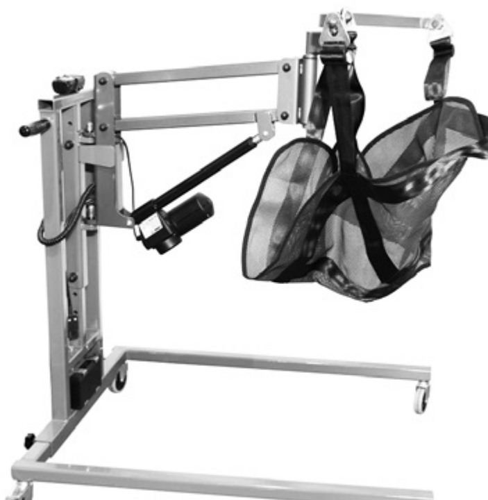
Mobility Engineering: Sling Lift