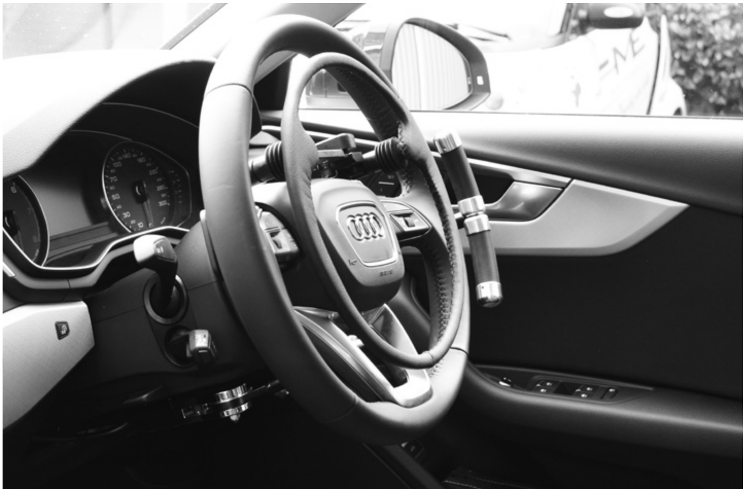
PME: Over Ring