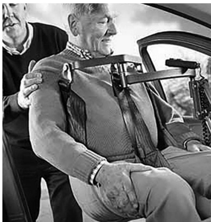
Mobility Engineering: Sling Lift