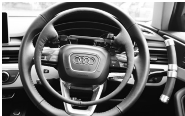
PME: Over Ring

Satellite accelerators are small units which are worn like a glove while driving to control accelerator functions. They are available in left and right-hand models and are great for people with limited arm movement because they are controlled solely by a person's thumb movement and can be worn while holding the steering wheel or using other equipment. They come in two main types, wired and wireless. Wired models are directly attached to the car via a cord, the main benefit of wired satellite accelerators is that they are around half the size of the wireless versions and do not need to be recharged. Wireless versions communicate with your vehicle electronically but need to be recharged regularly.