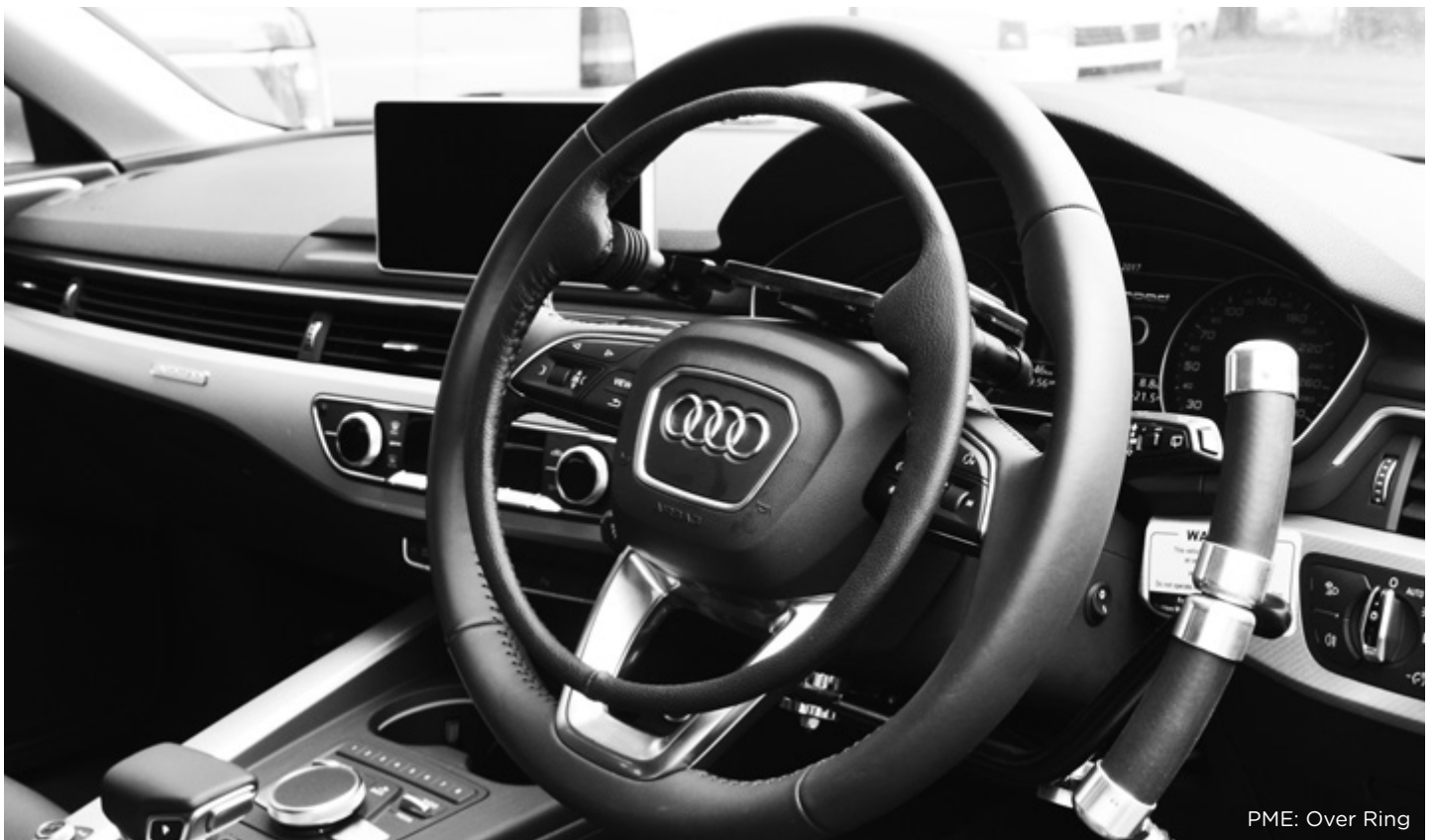
PME: Over Ring