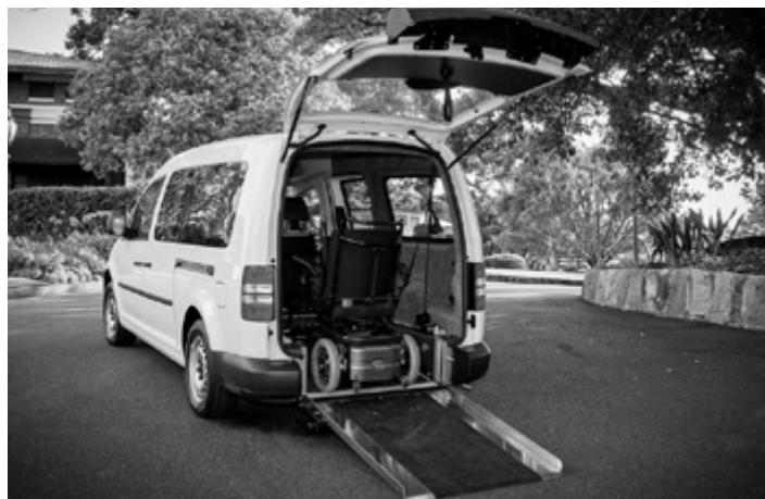
Auto Extras: Rear Entry WAV

See also: Brakes, Pedal Extensions, Vehicle Certification and Compliance