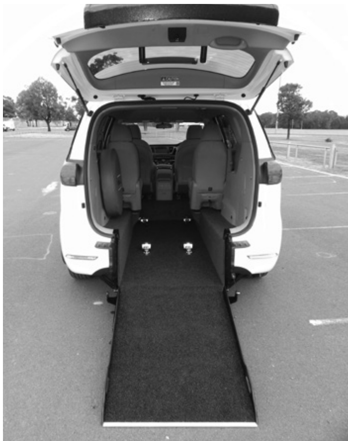
Freedom Motors: Rear Entry WAV