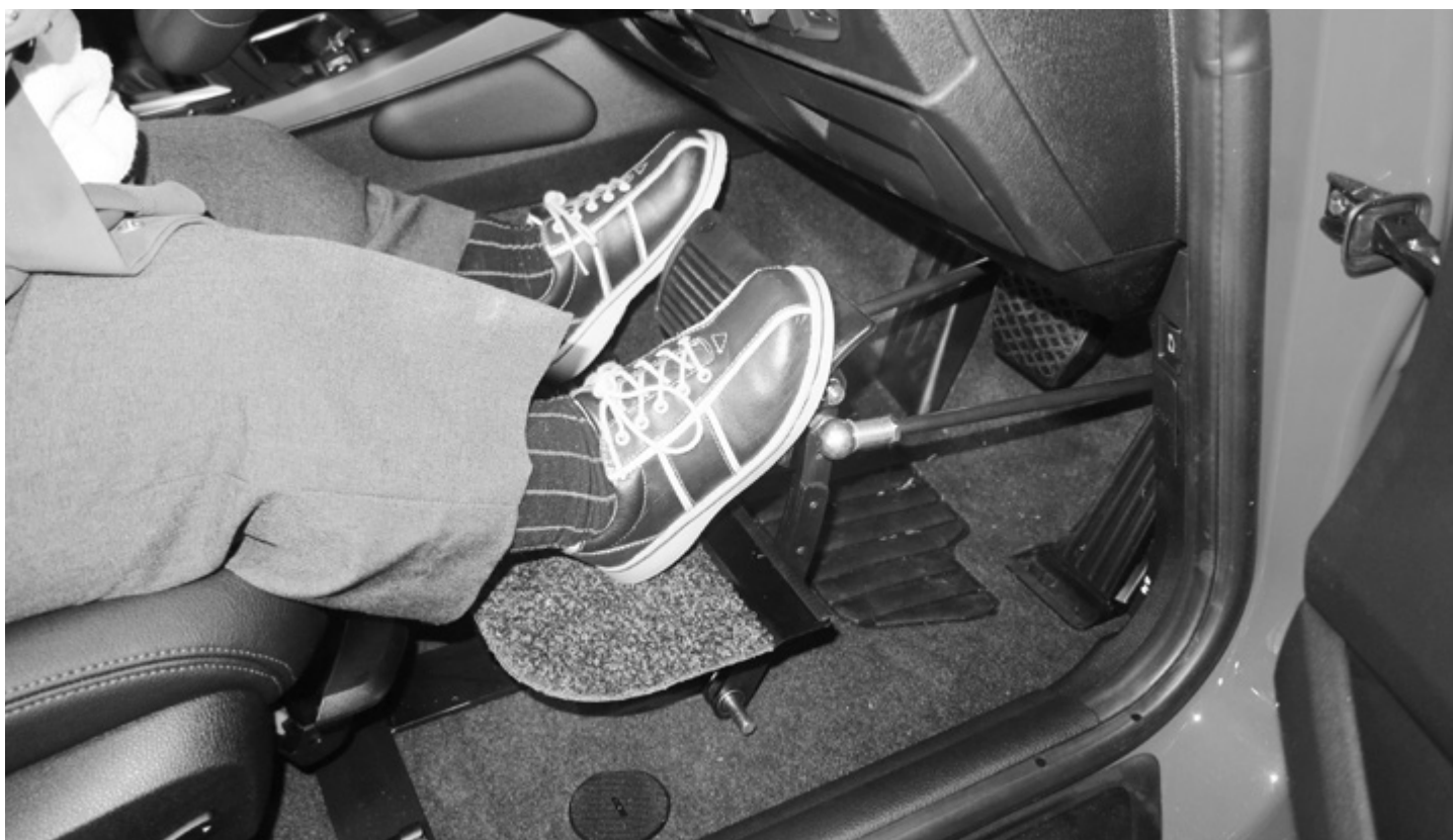
PME: Pedal Extensions

Some pedal extensions also include a quick release raised floor assembly, allowing drivers to rest their feet on the floor when not in use. Pedal extensions are available in either fold away or removable versions, allowing other drivers to use the car in the regular way.