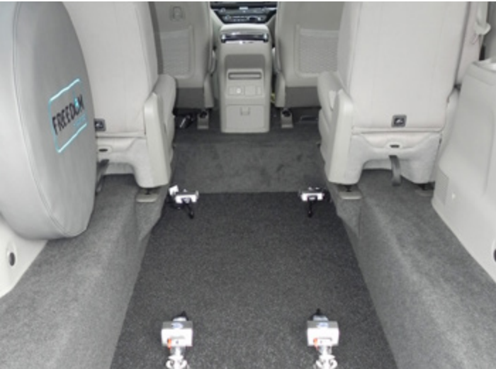
Freedom Motors: Wheelchair Dock

Wheelchair Docks are mechanical lock down systems. Docking plates are attached to the floor of your car and to the bottom of your wheelchair. They can be fitted to both manual and power wheelchairs but not all wheelchairs are compatible. Your vehicle converter will be able to advise you whether your wheelchair is suitable. Wheelchair Docks are usually quicker to use than Tie-Down Systems and don't require any bending or kneeling, making them a great option if your carer has limited mobility. Wheelchair Docks also often come with quick release buttons and other automatic features. They are a great choice for people who wish to drive independently because they don't require the assistance of a carer to use.