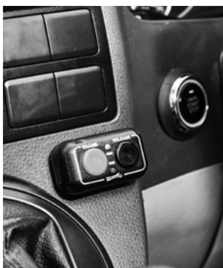
PME: Electronic Hand Brakes

There are a range of braking options available and many are built into modified accelerator systems. For example, both accelerator rings and satellite accelerators are generally purchased with braking mechanisms included. Other braking systems include: