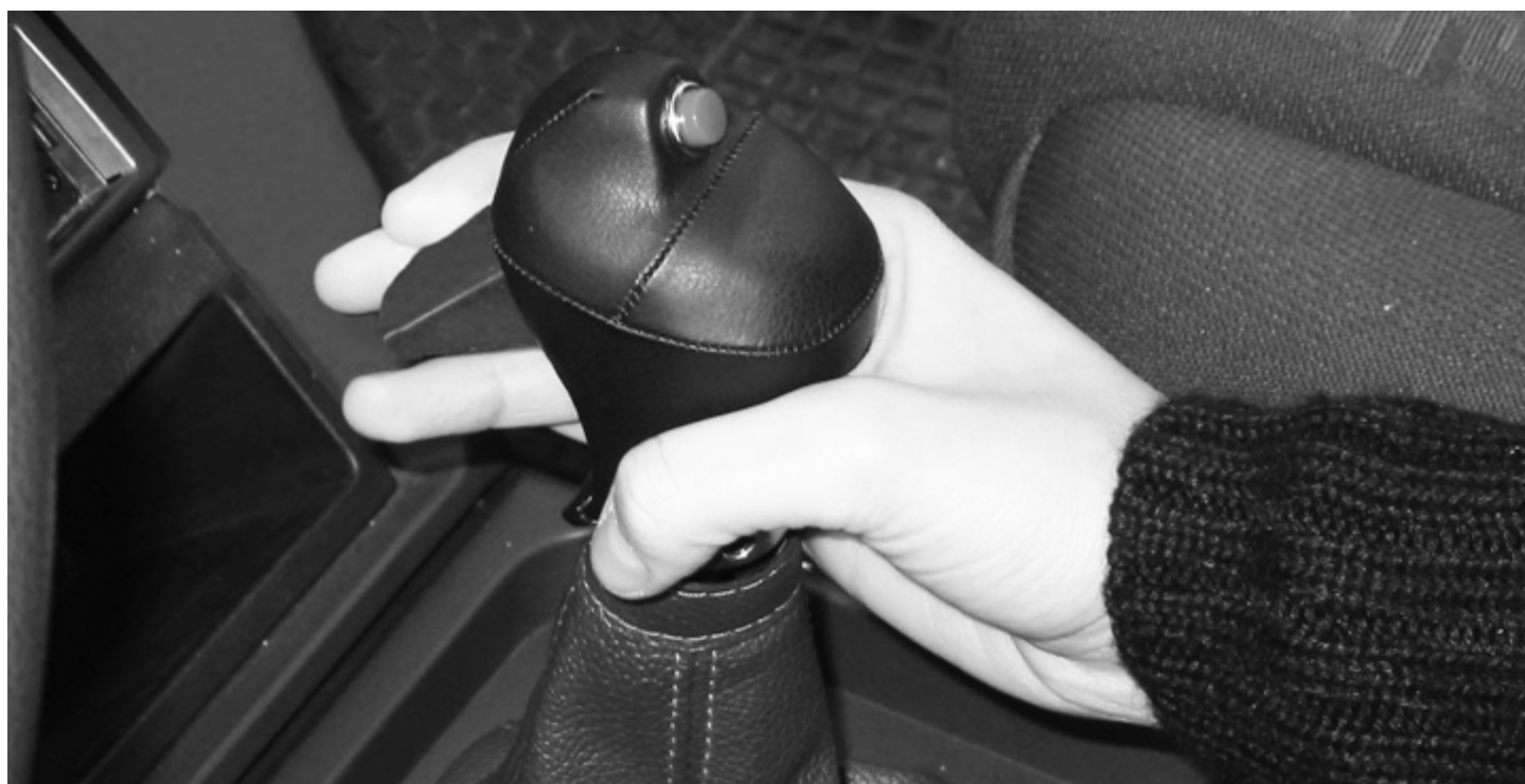
Total Ability: Electronic Clutch