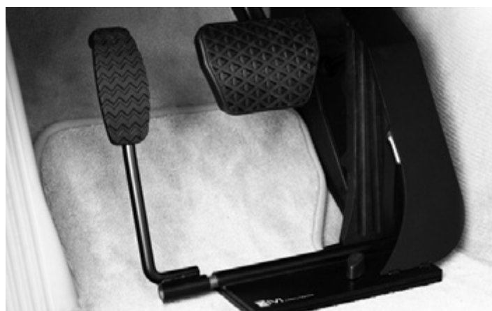
Mobility Engineering: Left Foot Accelerator