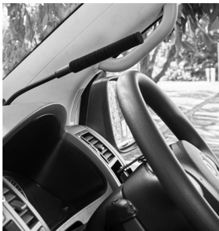
Total Ability: Voice Command

Voice command technology can be used to operate your vehicle's secondary controls. Voice command units connect directly to your car for instant control of windscreen wipers, windows, lights, horns and indicators. Many voice command units can be trained to recognise your specific voice, making them accessible to people with heavy accents and some types of speech impediments.