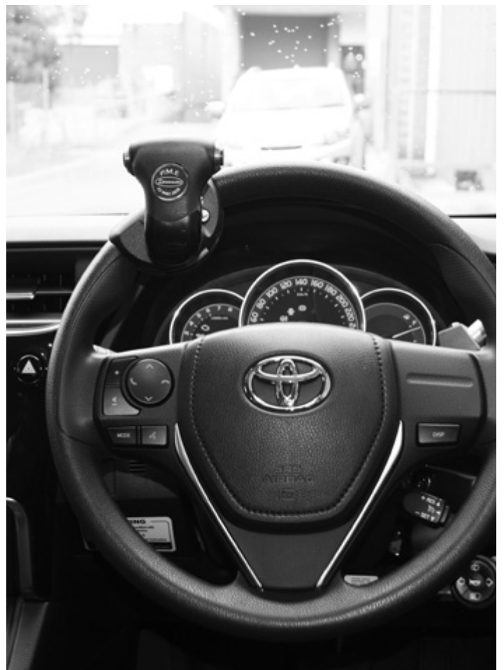
PME: Easy Spin