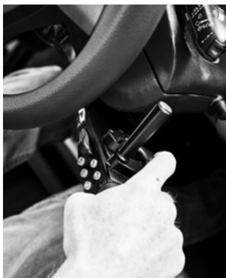
Total Ability: Brake Levers

They are great for people with limited hand or arm strength. Electronic hand brakes can be installed in most models of car.