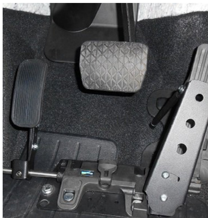
Asquith Mobility Solutions: Foot Controls

Foot-controlled steering can be complimented by voice controlled secondary functions for lights, indicators, windscreen wipers and the like, allowing for hands-free driving. Foot controls are currently only available in Australia from a limited number of manufacturers. If you are considering foot controls make sure that choose a converter that is familiar with this technology.