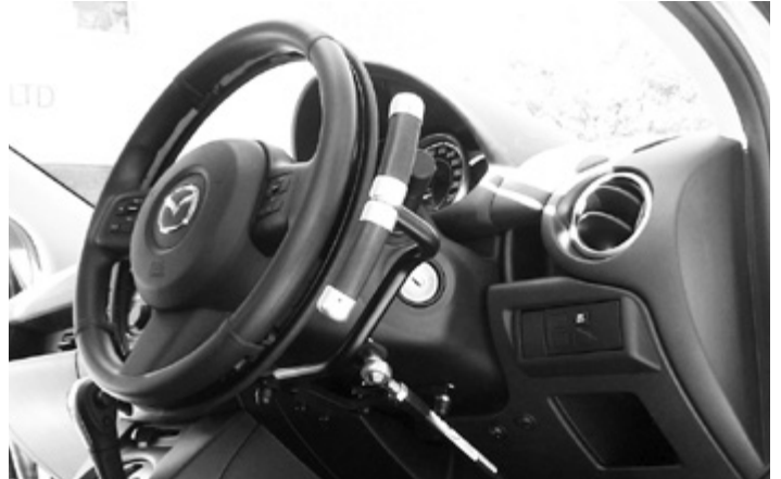
PME: Ghost Under Ring

Brakes can also be incorporated into the controls. Gas rings mounted in this way are known as Over Ring Accelerators or Under Ring Accelerators.