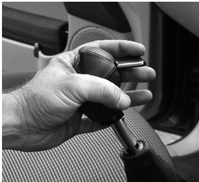
PME: Mitsubishi "Duck" Clutch"

The mechanism is controlled by a computer, which communicates directly with your vehicle's clutch pedal. The computer can be programmed to suit your individual driving style, allowing for smooth transitions. Most electronic clutches can easily be turned off, allowing the vehicle to be driven in the traditional way.