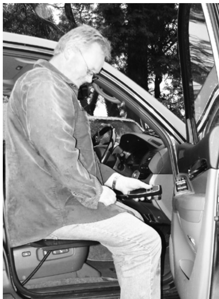
PME: Transfer Board

See also Access, Lifting Systems, Occupational Therapist