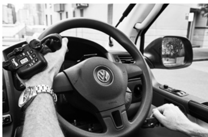
Total Ability: Satellite Accelerator

See also: Brakes, Pedal Extensions, Vehicle Certification and Compliance