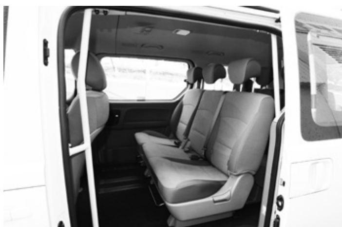
Auto Extras: Access Grab Rails