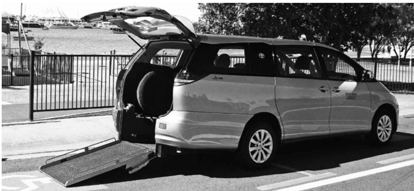
K+M Kite: Rear entry WAV