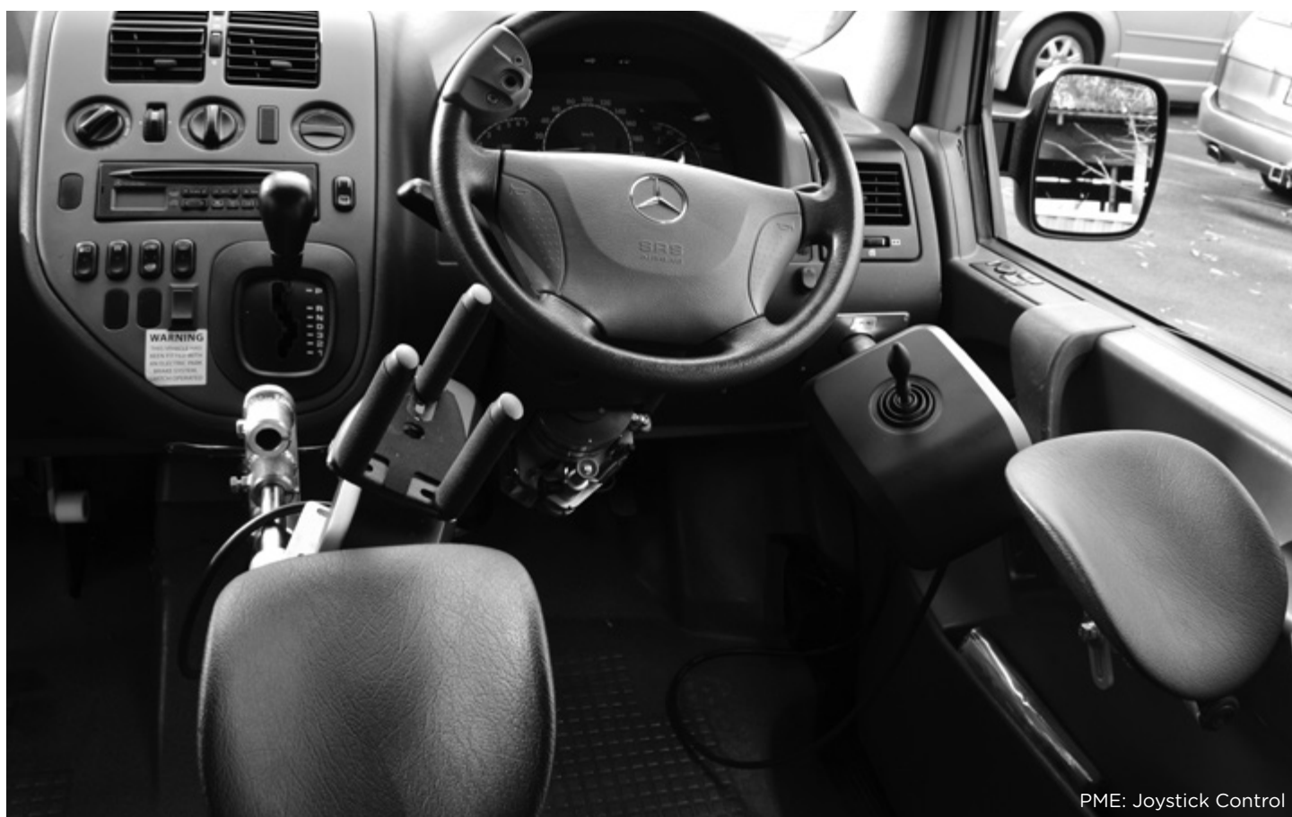
PME: Joystick Control

These are very advanced driving controls that operate steering and brakes electronically. Because any failure of the system would be extremely dangerous, these modifications require stringent testing and multiple redundancies to ensure their safety. Joystick control is not available from all vehicle converters; if you are considering joystick control, choose a converter who is familiar with the technology.