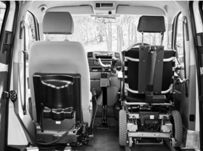
Total Ability: Wheelchair Dock