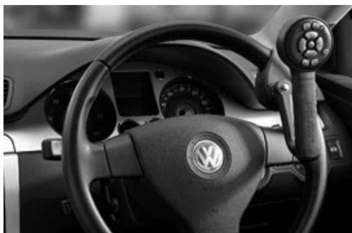
Asquith: Secondary Hand Controls