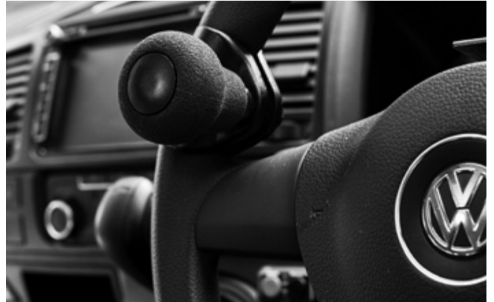
Total Ability: Spinner Knob