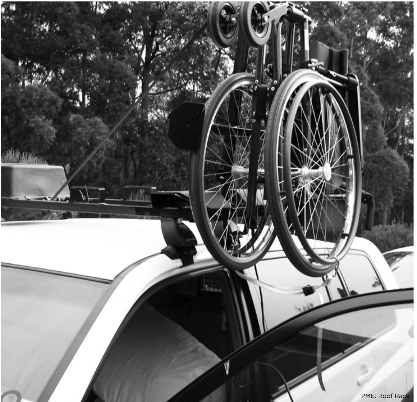
PME: Roof Rack

Speak with your vehicle converter about how often you should service your car and any disability related conversions to ensure that they stay in optimal condition.