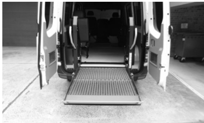
Asquith Mobility Solutions: Wheelchair Loader