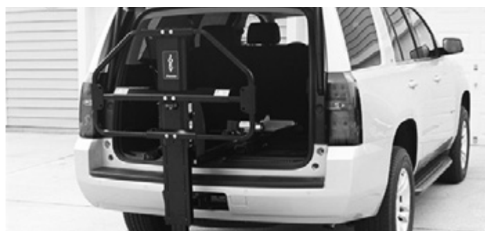
Mobility Engineering: Tow Bar Mounted Wheelchair Carrier

Storage boxes are a great way to store general mobility equipment. They secure all your gear safely, making them easy to find and ensuring that they don't become hazards in case of an accident. They are available from small sizes perfect for storing wheelchair restraints, up to large boxes that can hold manual wheelchairs or walking frames. Storage boxes can be fitted to the vehicle internally or externally, depending on their size.