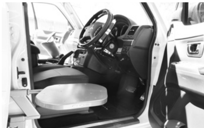
PME: Transfer Board

Talk to your Occupational Therapist if you have any doubts about whether you can transfer and what kind of equipment you will need to do it safely.