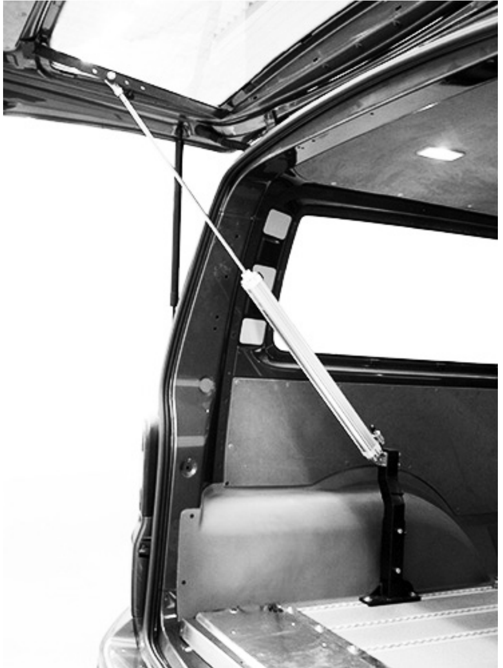
Mobility Engineering: Automated Door Opener

Straps can also be attached to rear doors to make them easier to reach for wheelchair users or people of short stature. Some wheelchair hoists for converted vehicles are also available that will automatically close doors after stowing your chair.