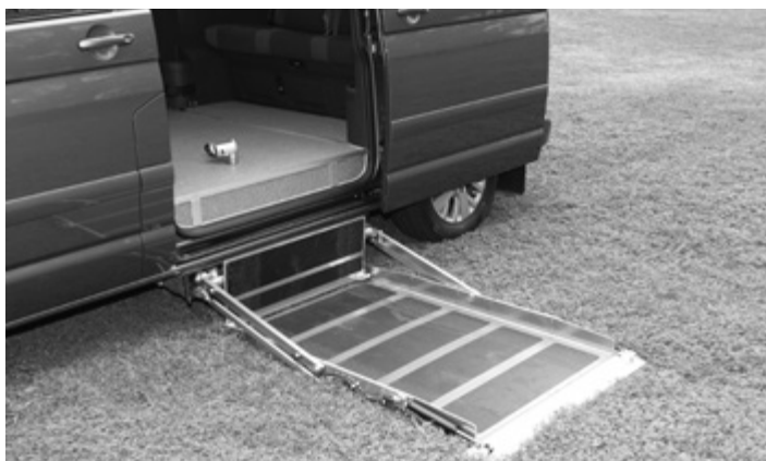
Auto Extras: Wheelchair Loader

Wheelchair Accessible Vehicles can be accessed using either lifts or ramps. Lifts may be more suitable for some manual wheelchair users, who may struggle to push themselves up ramps independently.